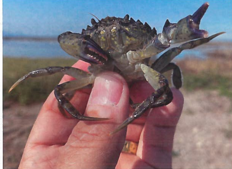
Karl Mueller, Lummi Natural Resources (2)

"The sea pond appears to be, in some ways, a nearly perfect incubator for green crabs," Grason said. "The enclosure protects the site in such a way that it creates conditions we don't really see on that large of