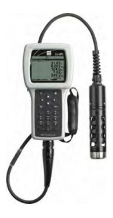
Figure 2.1 and Figure 2.2 illustrate the YSI 556 components and keys. The YSI 556 instrument consists of the hand-held instrument, with display and keys, cable, and sonde. The sonde is fitted with several sensors, described in more detail in Section 2.1.1, and is covered with a probe guard during use in the field. Note that the YSI 556 is stored with the calibration cup fitted over the sensors (Section 2.3).