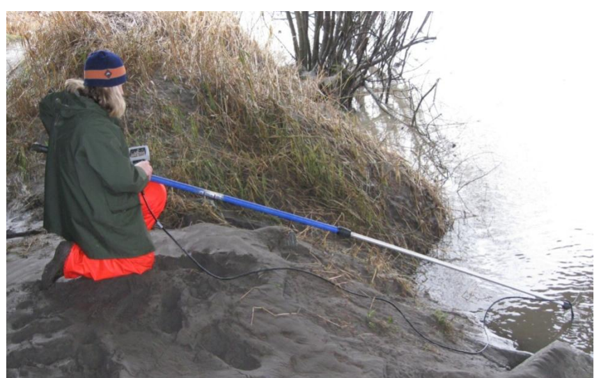
Figure 4.1 Surface Water Quality Sample Collection Using a Sampling Wand

1. Suspend the probe by the cable from the sampling wand. The probe should hang somewhat from the wand so as to allow the probe to be submerged in water without immersing the wand. See Figure 4.1.